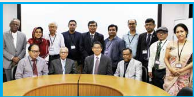
JUAAB EC & AC with H.E Mr. Ito Naoki, the Ambassador of Japan to Bangladesh at the Embassy of Japan