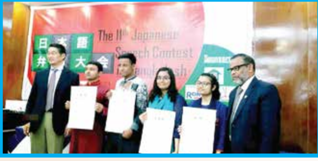
Japanese Language speech contest winners with the Ambassador and the JUAAB President