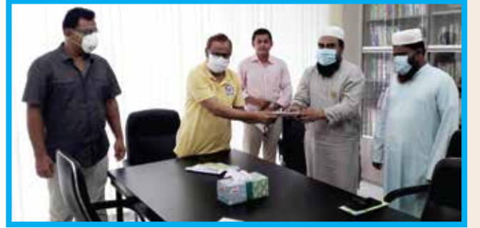
JUAAB donated 1 Lac Tk. to Al Markajul Islami, an organization involved in burrial of COVID-19 dead bodis