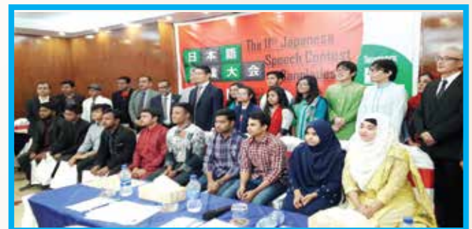
Japanese Language Speech Contestants