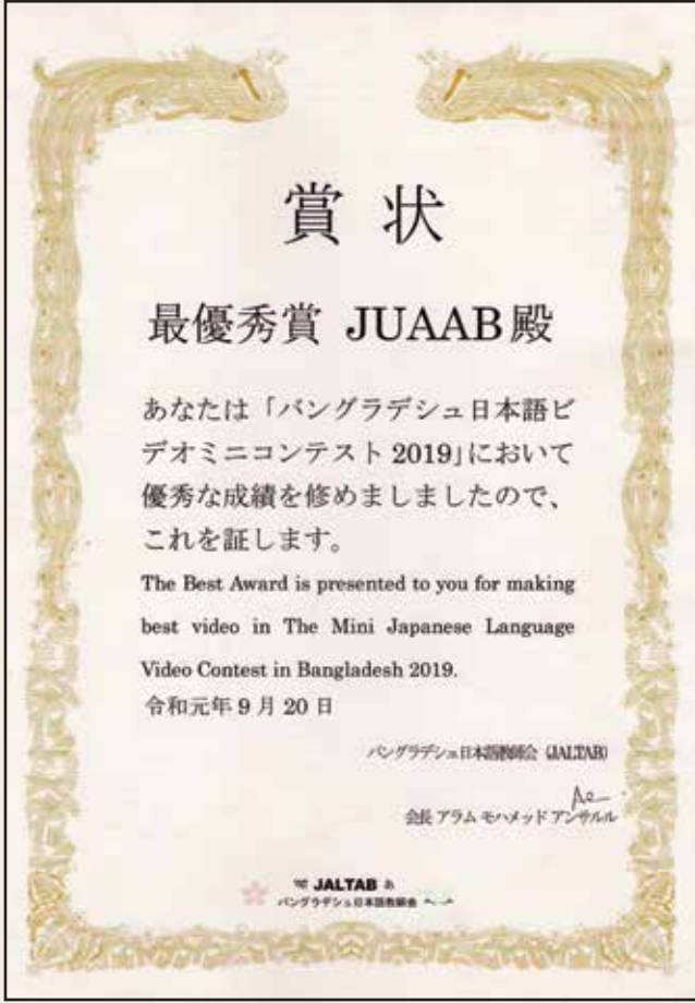
First on video contest, Certificate as Language School