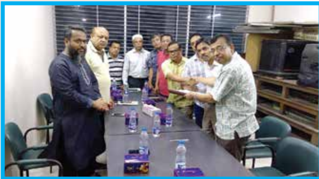
EC Hand Over-Take Over