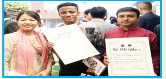
JUAAB Japanese speech contest winners with the language teacher