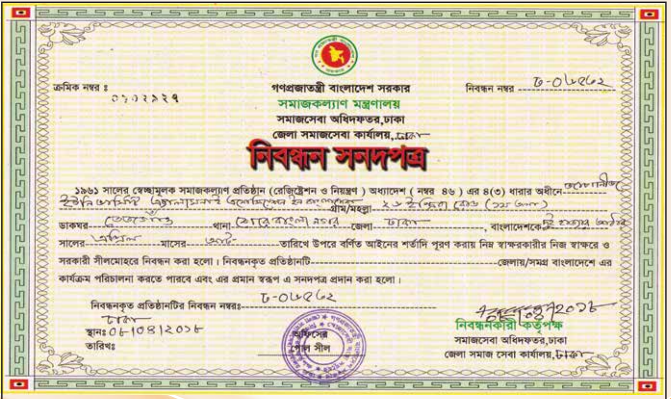
Social Welfare Certificate